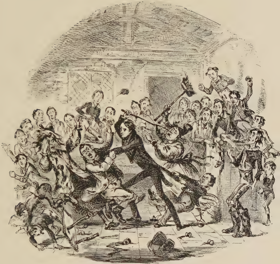
NICHOLAS ASTONISHES MR. SQUEERS AND FAMILY.